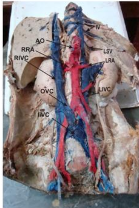
Fig. 2 Double Inferior Vena Cava and Left IVC Continuing as Azygos Vein

AO : Abdominal Aorta IV : Intercostal Veins RRA : Right Renal Arteries LSV : Left Subcostal Vein RIVC : Right Inferior Vena Cava LRA : Left Renal Arteries OVC : Oblique Venous Channel LIVC : Left Inferior Vena Cava IIVC : Interiliac venous channel