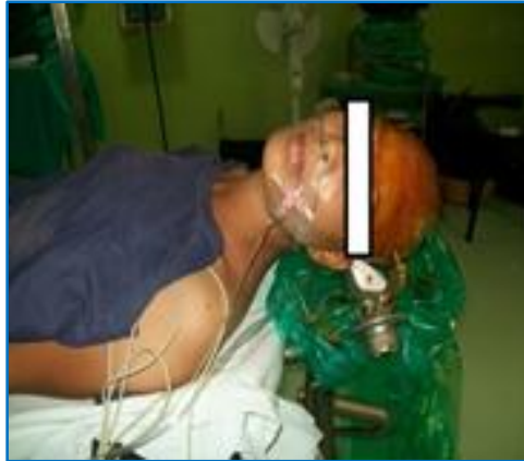
Case No. 2

DISCUSSION: Although awake craniotomy is well established for epilepsy surgery, only recently it has become more popular for resection of brain tumors involving eloquent areas and removal of supratentorial tumors. 5 The benefits include an increased lesion removal, improved survival benefit 1 , shorter hospitalization time, reduced cost and a decreased incidence of postoperative complications. 6 One of the most important considerations for awake craniotomy is careful patient selection. The patient should cooperate in an unfamiliar and stressful environment for an extended period of time. Infact, the only absolute contraindication for awake technique is an uncooperative patient. 7 A Our anesthesia team in preoperative visit detailed about expected discomforts and level of co-operation expected, potential and tasks that will be performed for motor testing.