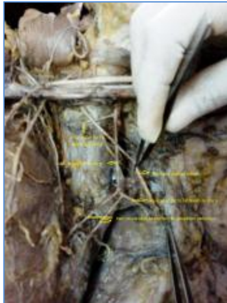
Fig. 1: Sub scapular artery, its collateral and terminal branches in female