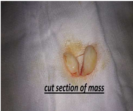
CUT SECTION OF MASS