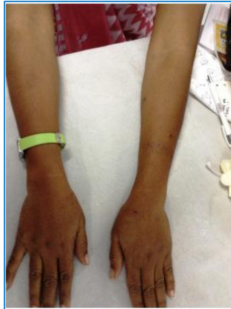
Fig. 3: After Treatment