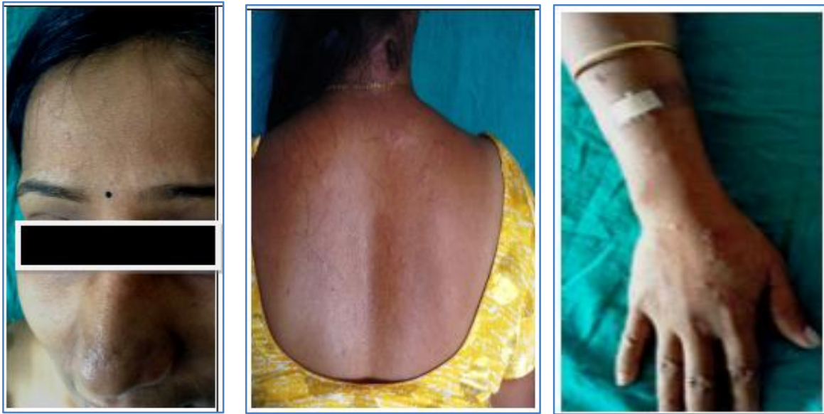
Fig. 1-a, b, c- erythematous papules plaques over face, upper back and dorsum of hands

Differential diagnosis of tumid DLE, Jessners lymphocytic infiltration of the skin, polymorphic light eruption, sarcoidosis and rosacea were considered.