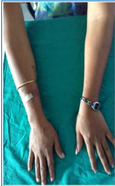
Fig. 3: Before Treatment

Skin lesions subsided after 6 weeks treatment (Fig. 3). Treatment was stopped and the patient was followed up for 1 year. There was no recurrence of the lesions till now.