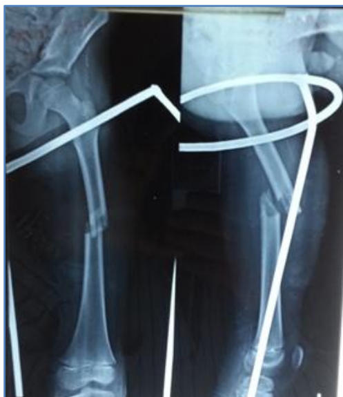
Figure 1: X-ray images of fracture shaft femur 9 year old boy: pre op