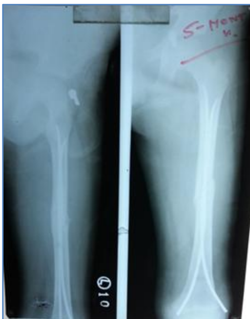
Figure 3: X-ray images of fracture mid shaft femur of 9 year old boy: at union (12 weeks)