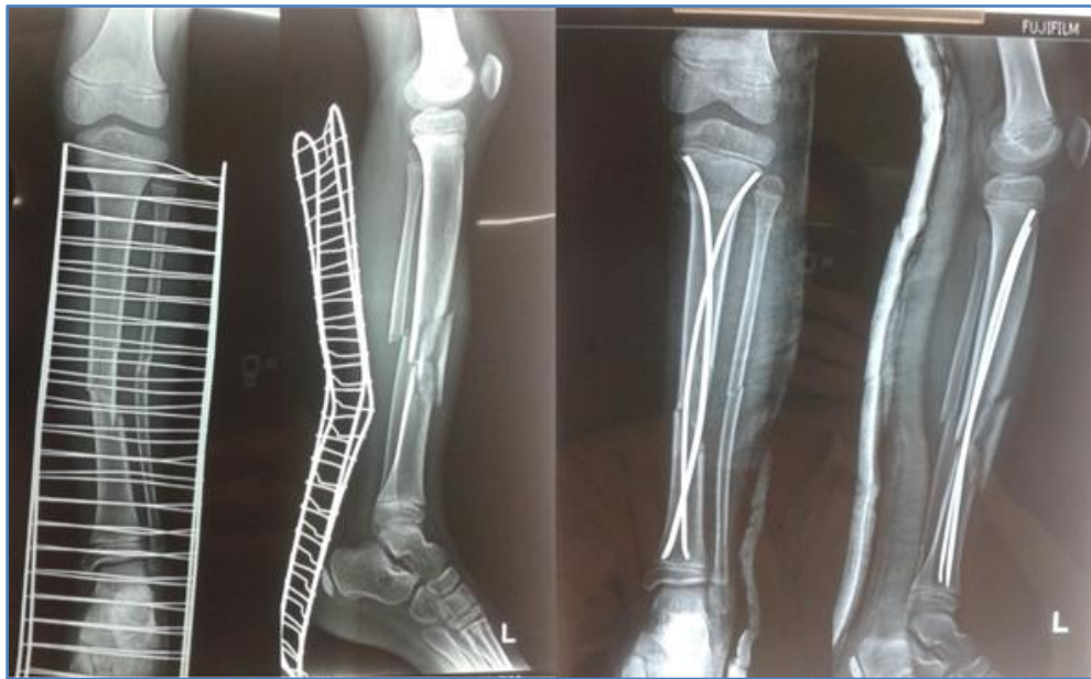
Figure 5: Pre-op and post-op x-ray images of fracture mid shaft tibia treated with TENS