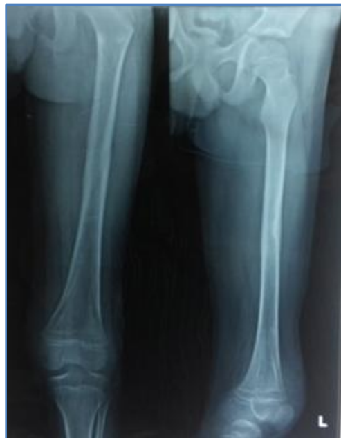
Figure 4: X-ray images of fracture mid shaft femur of 9 year old boy: following implant removal