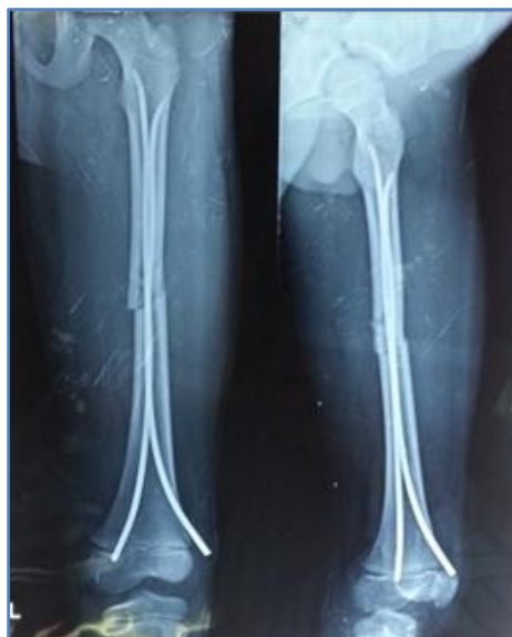
Figure 2: X-ray images of fracture shaft femur of 9 year old boy: immediate post op