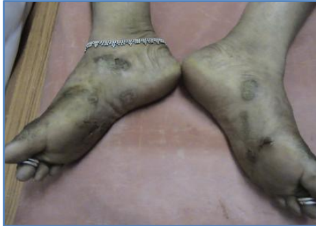
Fig. 1: Hyperpigmented plaques on the soles – lichenoid drug eruption