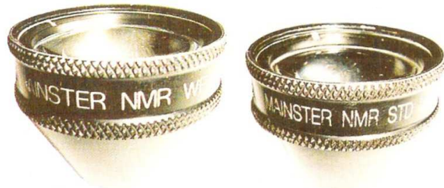
Mainster Wide Field Lens