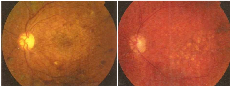
Grid Laser Spots