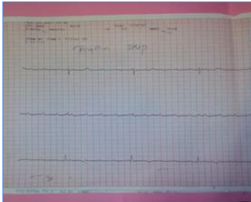
Leads I, II, III

ECG pattern of the baby indicating 3 rd degree heart block.