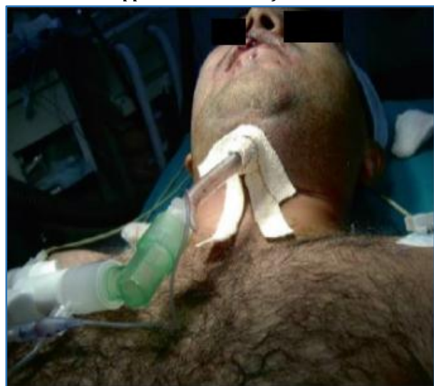
Fig. 3: Submental Exit and Stabilization of Endotracheal Tube with Adhesive Tape and Sutures