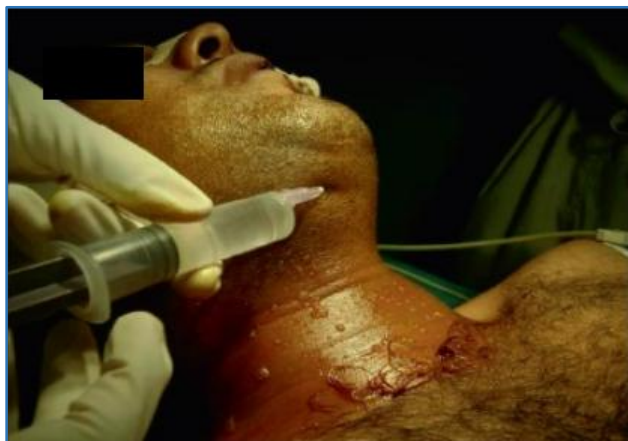
Fig. 1: Anaesthetizing the Local Area

cavity and in other 5 the cuff was brought out from the midline incision. At the end of the surgery submental intubation was converted to oral intubation. The ET tube was pulled back intraorally in the reverse order, i.e. first the reinforced tube and then the pilot tube cuff. The submental skin incision was closed with interrupted silk sutures and intraoral incision left to heal by secondary intention. The patients were followed up on regular basis and assessment was based on postop morbidity in terms of function and aesthetics.