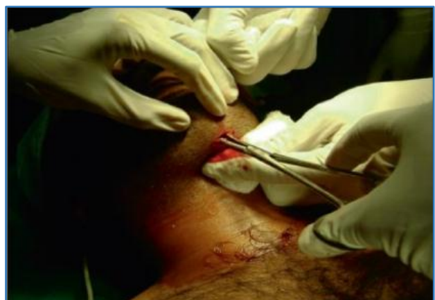
Fig. 2: Incision Placed and Tunnelling Done on the Medial Side of Mandible to Approach the Floor of Mouth