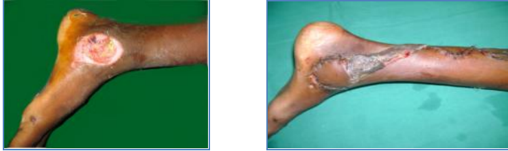
Fig. 1: Reverse sural island flap with externally placed pedicle.

length of sural fasciocutaneous flaps ranged from 7 to 25cm from the tip of lateral malleolus. 5 of these flaps underwent complete flap necrosis and 11 had partial necrosis which was later covered with skin grafting after granulation.