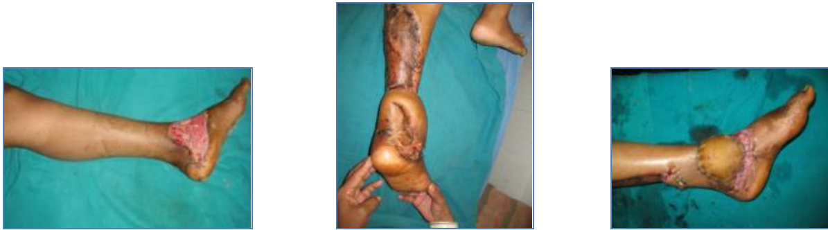
Fig. 5: Reverse sural artery fasciocutaneous flap.