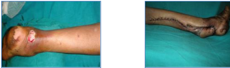
Fig. 2: Reverse sural island flap. Secondary defect primarily closed.