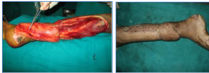
Fig. 7: Extended sural fascio musculocutaneous flap.

DISCUSSION: Reverse sural artery flap remains the workhorse flap for reconstruction of foot and ankle defects. The constant and reliable blood supply with ease of elevation makes it a preferable flap for these defects. The various modifications of the flap are done to suit clinical conditions and for better survival of the flap. Distal sural artery flap can be used to cover defects over medial and lateral malleoli, over dorsum of foot and ankle and weight bearing heel. Flap is safe in paediatric age group, with no difference in complication rates. Inclusion of both the accompanying vascular territories of the sural nerve as the main arterial supply and the lesser saphenous vein as an additional blood supply and to augment the venous drainage of the flap improves survival. Inclusion of skin over the pedicle as in peninsular and fasciocutaneous flaps facilitates better manipulation of the flap and increases margin of safety. Flap can be safely elevated from proximal 1/3 rd of leg by inclusion of mesentery like tissue between gastrocnemius muscles or a chunk of gastrocnemius muscle itself. Delay flap is preferred in high risk patients with diabetes, smoking and hypertension. The long pedicle sural artery fasciocutaneous flap is preferred in patients who have large defects