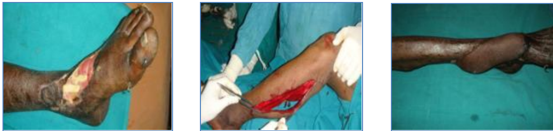
Fig. 6: Delayed reverse sural artery flap.