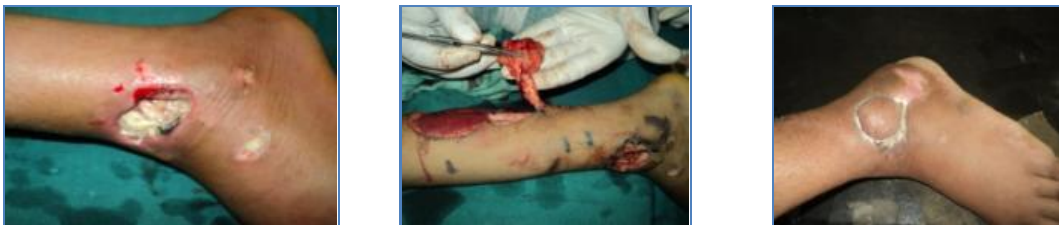
Fig. 3: Sural island flap with subcutaneous tunneling of pedicle