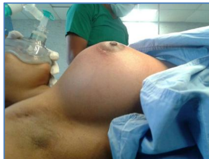
Fig. 1: Lateral view of giant fibroadenoma – Right Breast