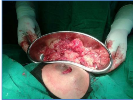
Fig. 2: Circumareolar incision, with complete excision of fibroadenoma by Swiss roll technique