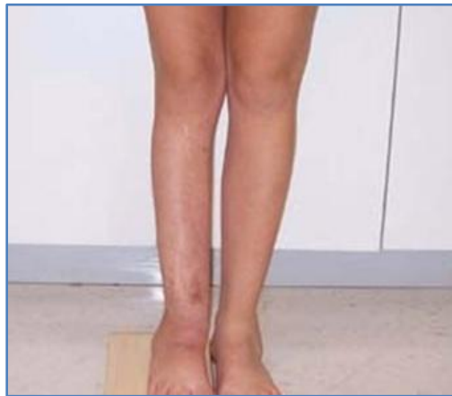
Deformity corrected and union achieved

DISCUSSION: Congenital pseudoarthrosis of tibia is rare condition with incidence ranging from 1:125000 to 1:140000 1 . It is associated with stigmata's of neurofibromatosis in 50 – 90 % cases. 2 The disease is usually detected by the age of two years, but it may take up to 12 years to be detected. 3