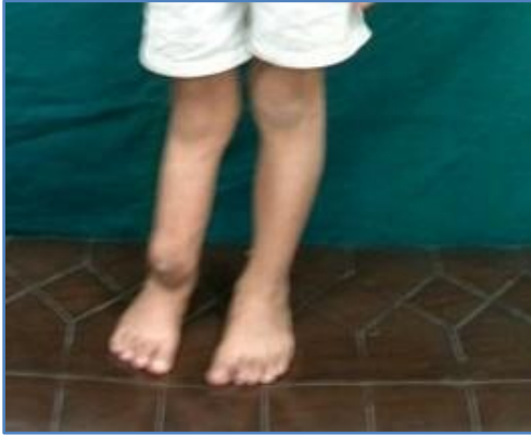
Clinical photograph showing anterolateral bowing of the leg

Later at the end of 9 months fixator was removed and the limb was immobilized in a long leg POP cast. The follow up x-rays taken at 12 months and 18 months showed signs of union and correction of deformity.