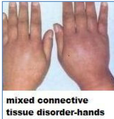
mtcd hand final