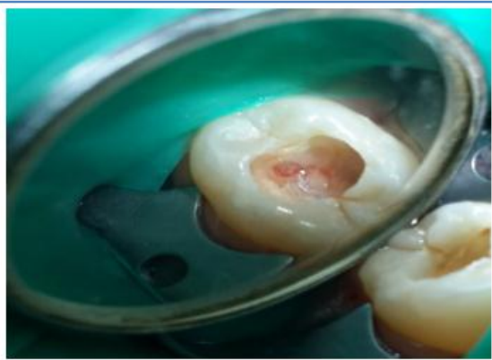
Fig. 2: Iatrogenic exposure of pulp