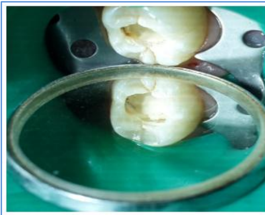
Fig. 3: Placement of biodentine over the exposure site