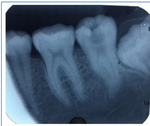
Fig. 5: Preoperative radiograph