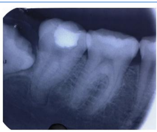
Fig. 6: Evaluation after 1 month