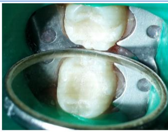
Fig. 4: Final restoration with composite