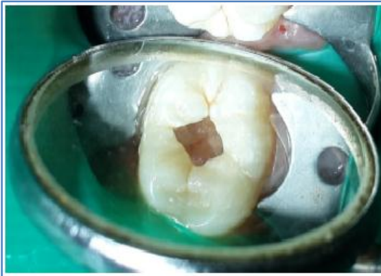
Fig. 1: Pre-operative picture showing deep carious lesion