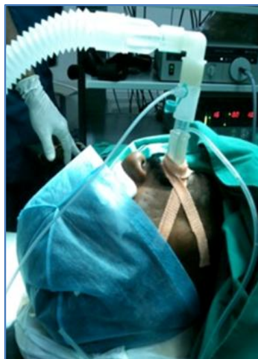
Figure 2: I-gel with Ryle's tube in situ