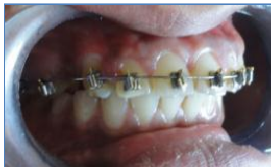
Fig. 5, 6: After 8 month of orthodontic procedure