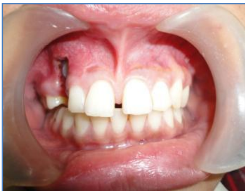
Fig. 1: Pre-operative view