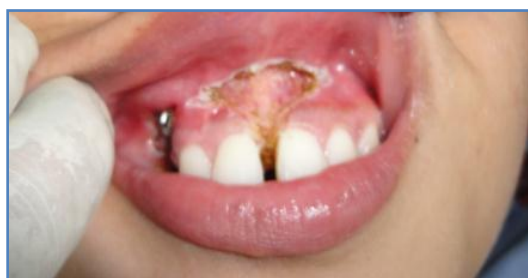
Fig. 4: After frenectomy using diode laser, no or minimal bleeding can be seen with clean and clear field