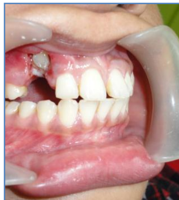
Fig. 2: Exposure of buccally impacted maxillary canine using diode laser