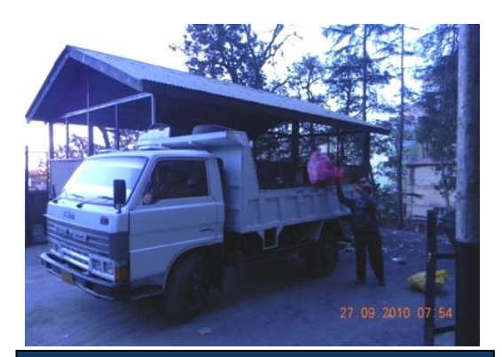
Fig. 4: Showing an Open type Off site transport vehicle of Govt Agency