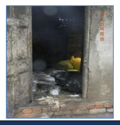
Fig. 2: Showing Central waste storage facility of one of the hospitals