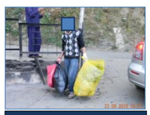
Fig. 1: Showing Onsite Transport by a cleaning worker