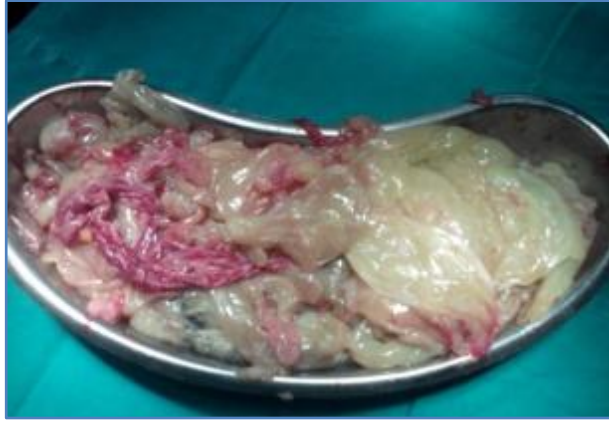
Fig. 1: Multiple greyish-white cystic mass