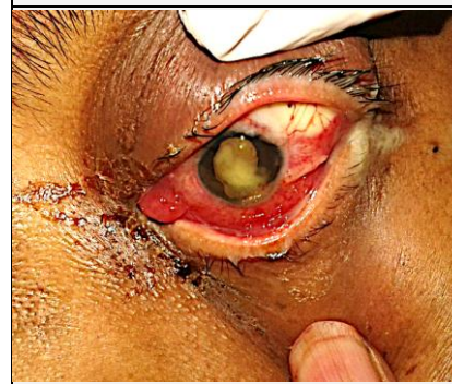
Figure 3. After Resolution of Symptoms

On 1 month follow up, there was complete resolution of inflammation and hypopyon. She then underwent a cataract surgery under the cover of topical steroids and antibiotics and visual acuity was restored.