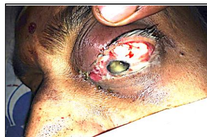
Figure 1. On Presentation

After one week, her symptoms began to ameliorate and there was marked improvement in her systemic and ocular condition. Her left eye showed a significant reduction in discharge and inflammation with gradual resolution of the hypopyon. Intraocular pressure also returned to normal. [Image 3]