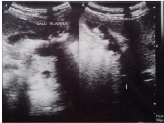
Figure 1. Ultrasonography Picture showing cholelithiasis