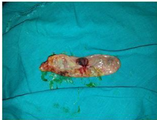
Figure 3. Gall Bladder Specimen showing Ectopic Liver