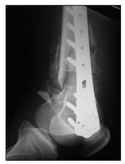
Fig. 2b: Radiographs of the left knee, lateral view, initial postoperative period.