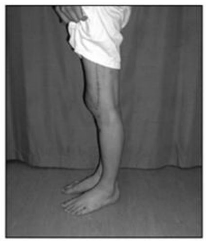
Fig. 3a: Full weight bearing, 4 months postoperatively.