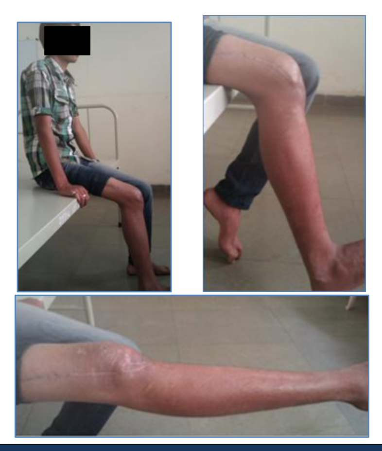
Fig 4: 6 Months post operative photo showing maximal flexion and complete extension