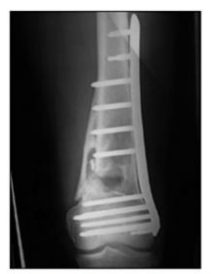
Fig. 4a: Radiograph of the left knee, AP view, 4 months postoperatively.