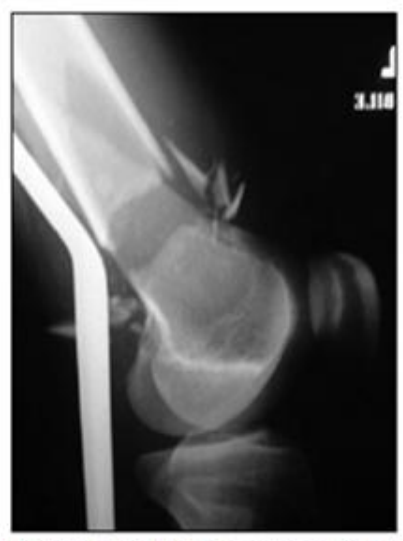
Fig. 1b: Radiograph of the left knee, preoperatively, lateral view.