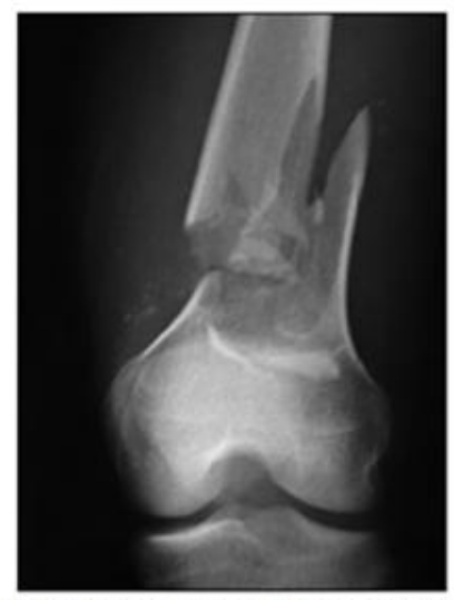
Fig. 1a: Radiograph of the left knee, preoperatively, AP view.