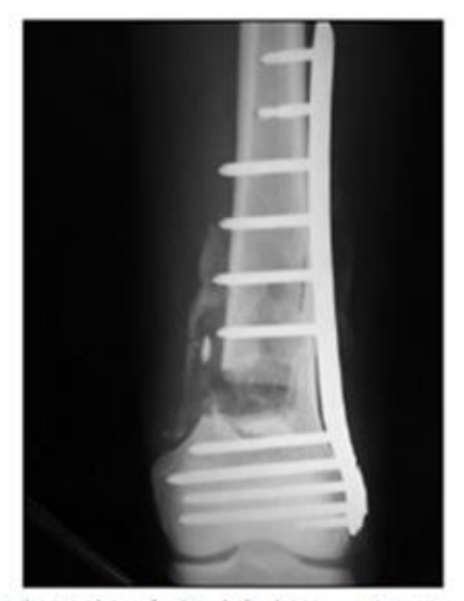
Fig. 2a: Radiographs of the left knee, AP view, initial postoperative period.