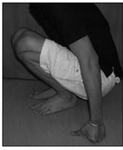
Fig. 3b: Full range of motion, 4 months postoperatively.