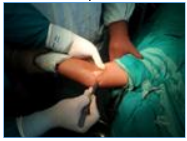
Minimal Fixation with Cancellous Screw and K Wire Pre-operative

All the 6 cases united clinicoradiologically, ranging from 90 days to 134 days (mean – 112 days). 5 patients had no pain, and 1 patient had mild pain. 4 cases had motion arc >100°, 2 cases had motion arc 50-100°. 5 cases had good stability, and 1 case had moderate instability. Based on the clinical criteria for evaluation of results, excellent results were obtained in 4 cases and good result in 2 cases. None of the cases reported with ulnar nerve injury.